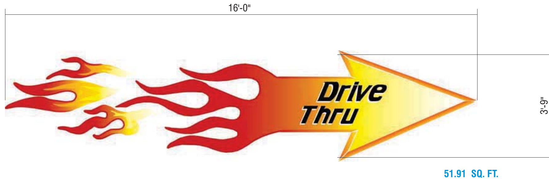
C DIRECTIONAL MURAL 1/2" = 1'-0" ONE (1) REQ'D