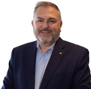
T. Lynn Tompkins Jr, Mayor of Cross Roads