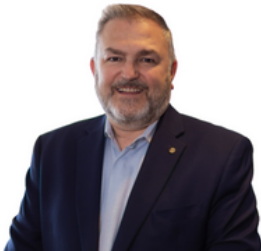
T. Lynn Tompkins, Jr. Mayor of Cross Roads