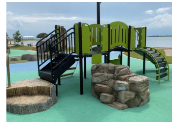
Sample of a playground at Lake Ray Roberts